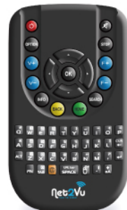
Net2Vu Qwerty Remote with Battery (AAA x 3)